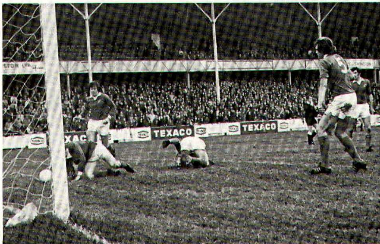
Although Gillingham's defence is beaten, the referee prevents Swindon scoring on this occasion.