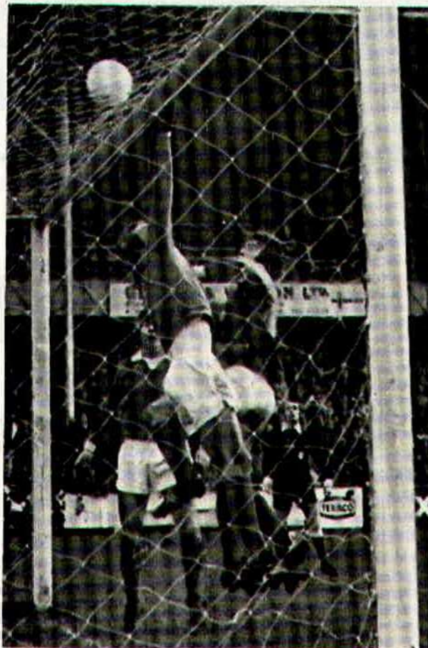
Gillingham's goal under pressure in Swindon's last home game.

Norman Fraser Ltd., of the Brunel Rooms.